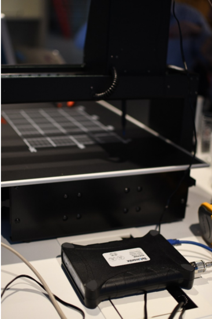
Figure 3. Tektronix RSA306B is the core spectrum analysis system processing the acquired data.

“The best companion spectrum analyzer to avoid long acquisition time is the RSA306B Spectrum Analyzer from Tektronix. This instrument is extremely flexible, small and reasonable in cost, but the real advantage is its real time acquisition speed. That allows to collect data quickly so that the full scan can be taken in a reasonable amount of time, and repeated whenever necessary, to immediately see the effect of our design corrections,” said Enrico Dente.